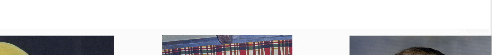
Thelma straightens Howie's hair before the prom (1970 or 71)