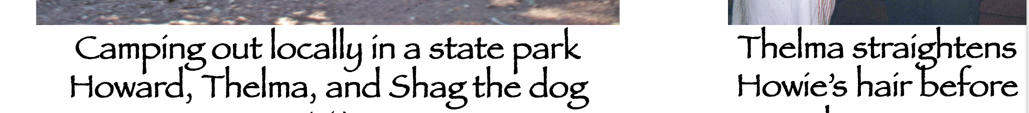
Camping out locally in a state park Howard, Thelma, and Shag the dog (1969)