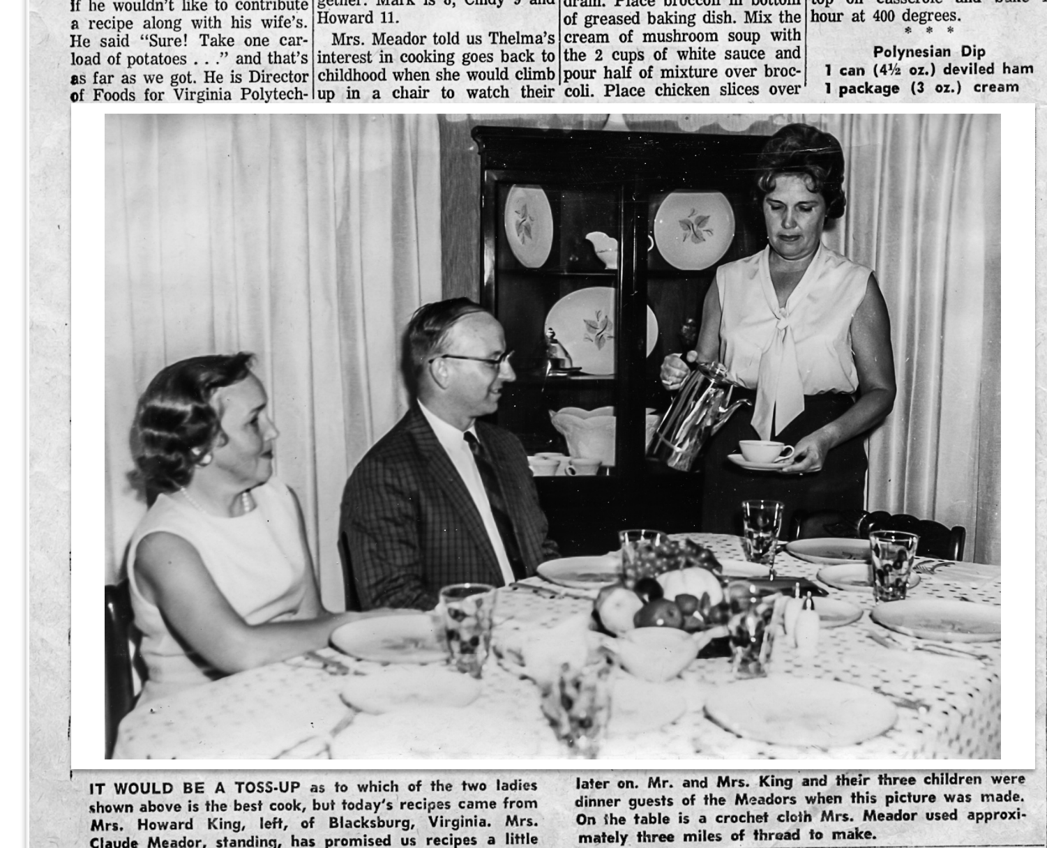
Newspaper article from Hopkinsville New Era (August 1965)