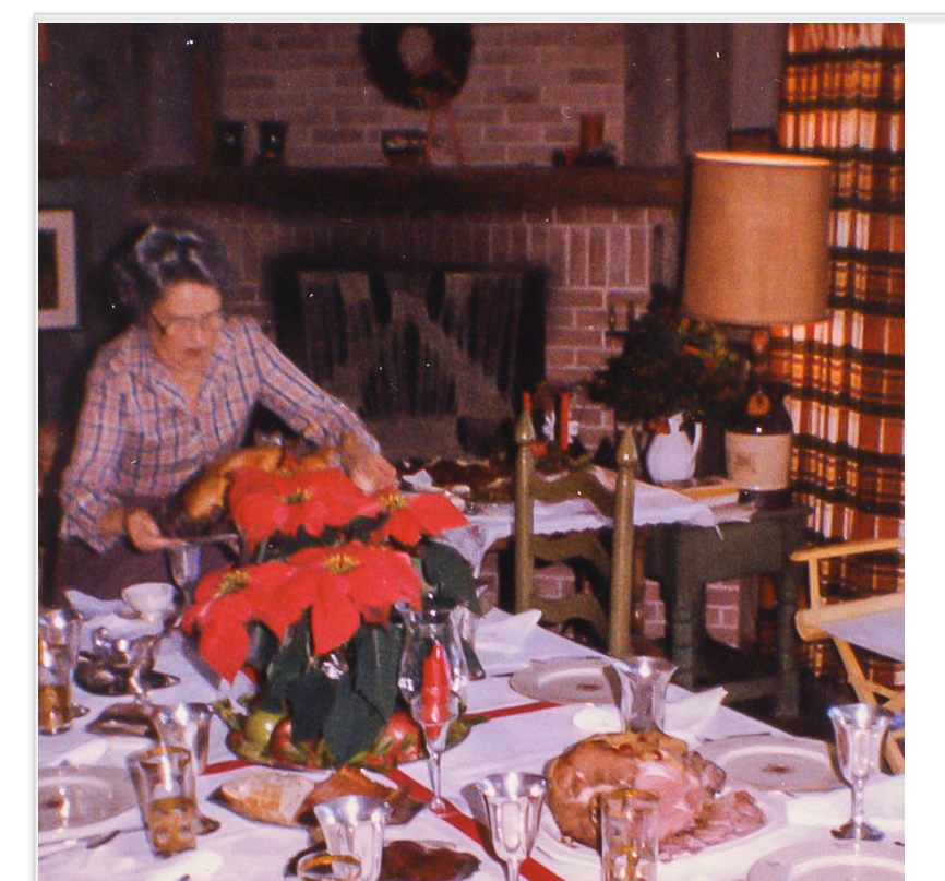
Setting out the Christmas turkey (1985)