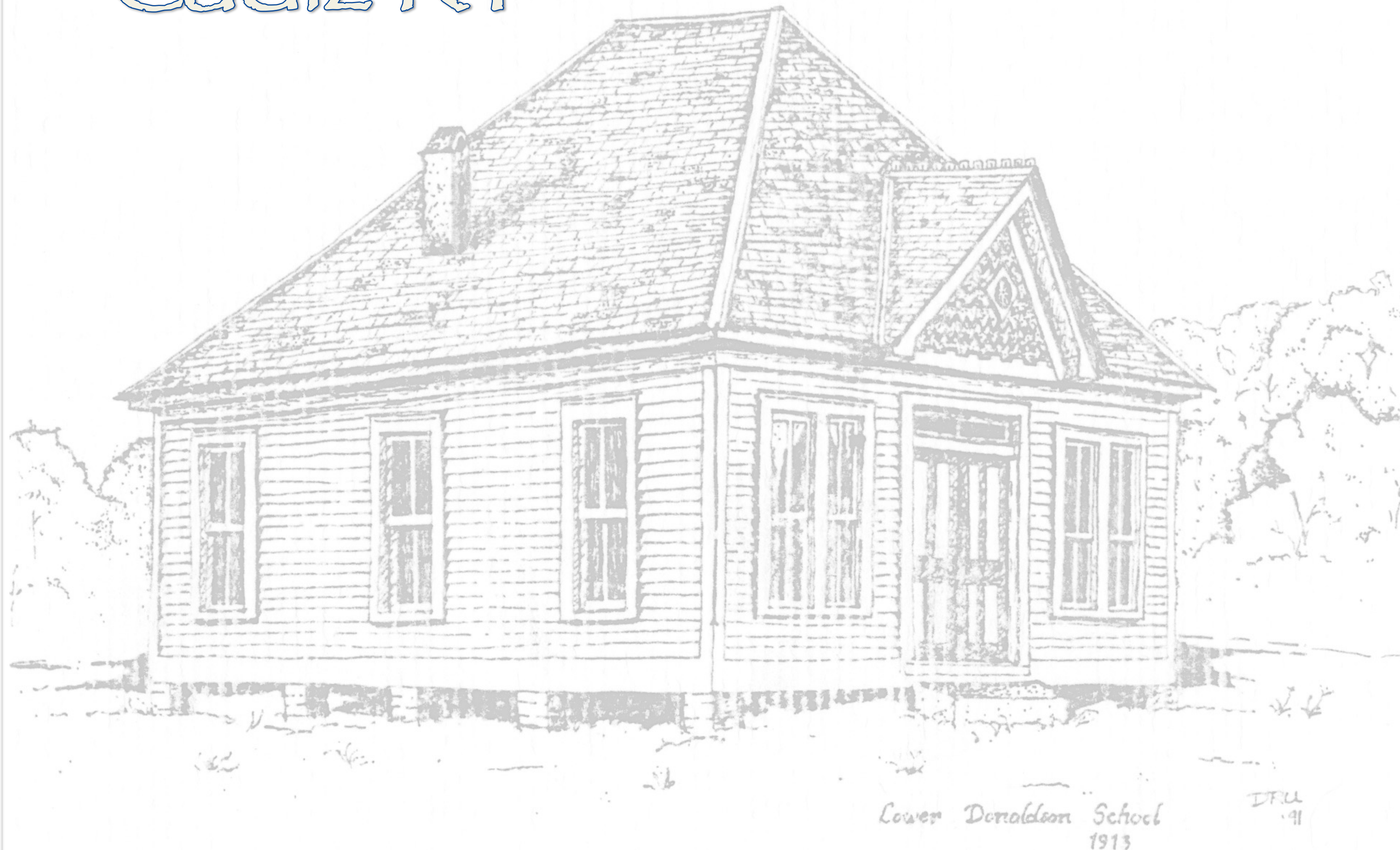
Lower Donaldson School 1913

The three pen and ink drawings used as the background on these posters hung on Thelma's bedroom wall.